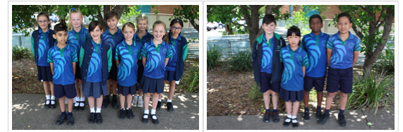
Term 4 Silver Award Winners