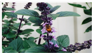
Stage 3 Projects