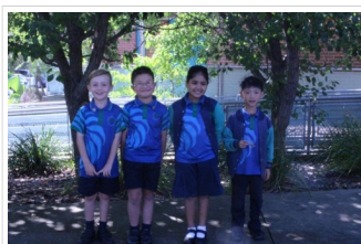
Silver Award Winners