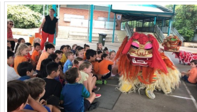
BHPS Celebrates Harmony Day