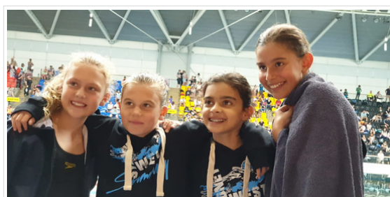
Junior Girls Relay Team